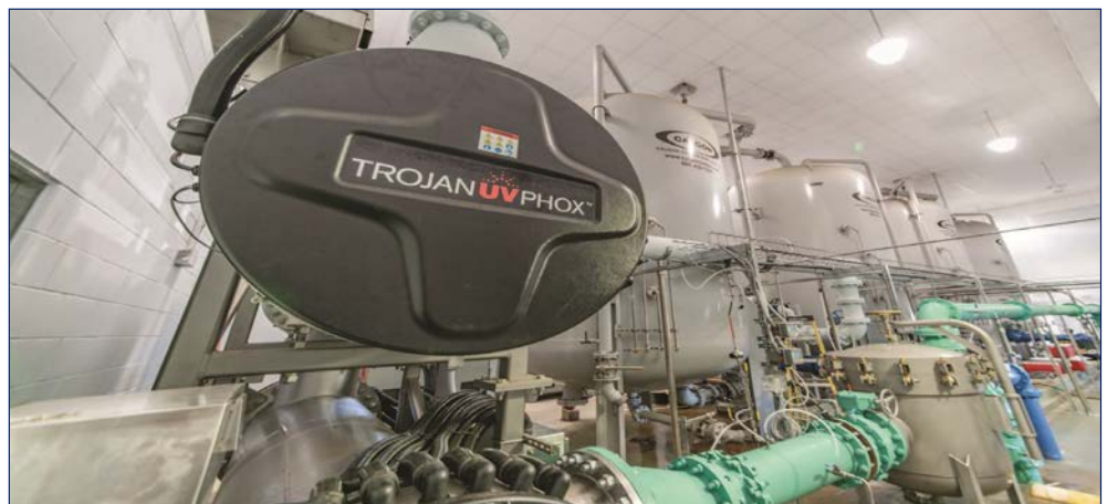
Advanced Oxidation Process (AOP) Treatment System