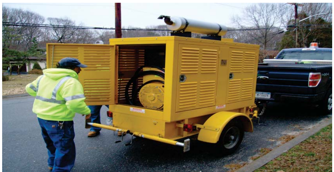
Portable Generator-On-Wheels In Use During Storm

The Board of Commissioners would like to thank the District staff for their exceptional efforts during the storm to allow the District to provide water service to the community.