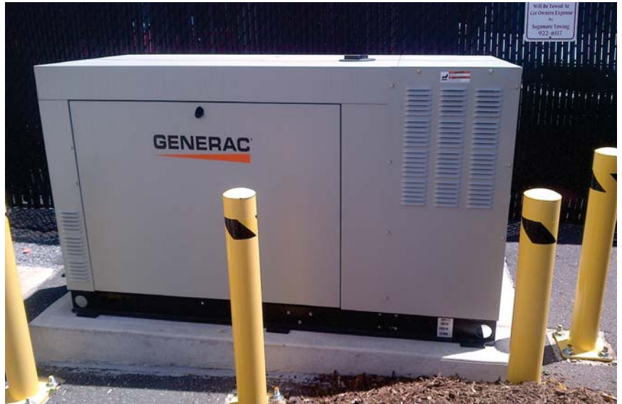
Administration Building - New Emergency Generator

The District is also planning on rehabilitating and repainting our 500,000 gallon elevated water storage tank at Mill River Road. This work is expected to start in the fall of this year and be completed in the spring of 2014.